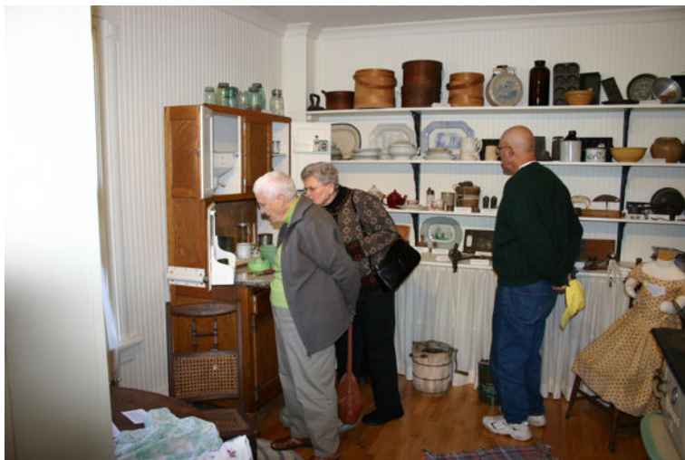
EHS members explore the kitchen at the Tolland Historical Society Museum.

Those of you who are planning to come to the winter open house to see the new exhibit should come before 4 p.m. so you have plenty of time to see it. The last three hours of the day will be very crowded.