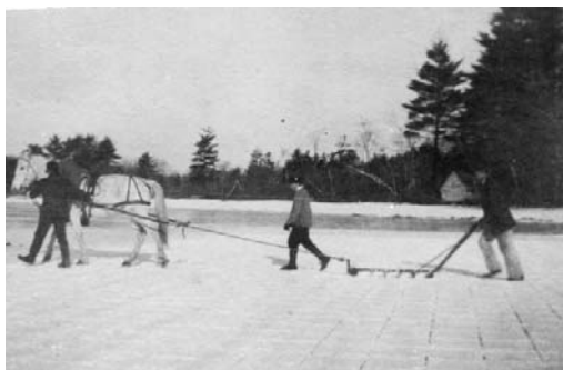
Ice harvesting at Crystal Lake

Winterfest --The museum will be open for Winterfest on Saturday, December 4, from 2:00 p.m. – 7:00 p.m. We have been working on an exhibit about ice harvesting to be displayed in the front parlor. A video, photos and tools will show how labor intensive the ice business really was and how refrigeration has changed our lives. We hope to move this exhibit to Hall Memorial Library early in 2011 and use this as a program for one of our winter meetings.