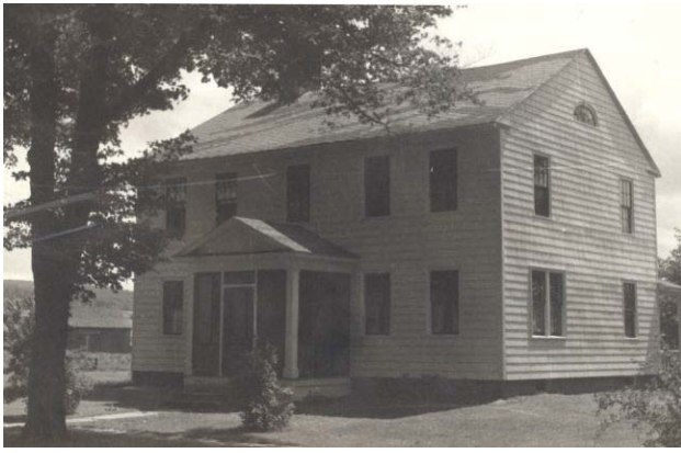
Photograph of the McKnight House from the Connecticut State Library's Digital Collection: "The WPA House Survey." The Census of Old Buildings in Connecticut, 1934-1937 was a Works Progress Administration (W.P.A.) project.

This anniversary highlights the need for exterior paint and repairs at the museum. We are presently hoping to accomplish these jobs with the help of our members either donating time or money. We are the caretakers of this wonderful and historic old house. Let's work to make this a proud 200th birthday of the house!