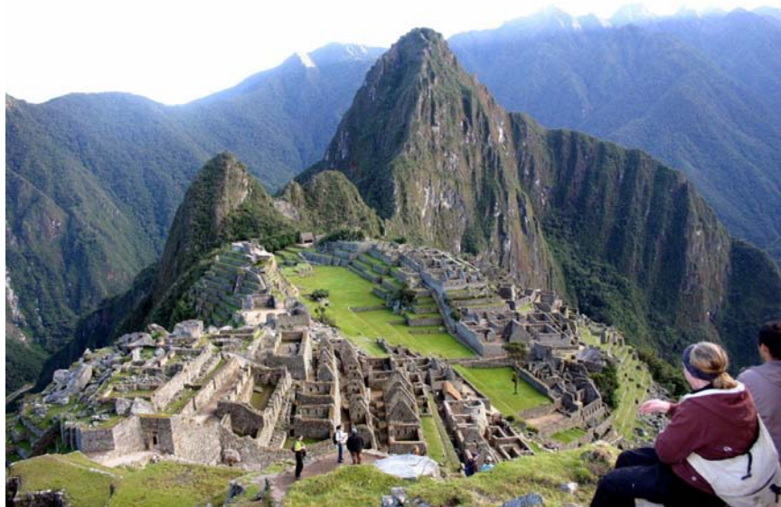
Photo of Machu Picchu