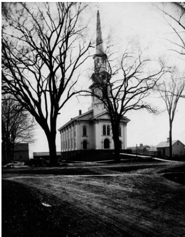
The third meeting house of the Ellington Congregational Church, built in 1867 and 1868.