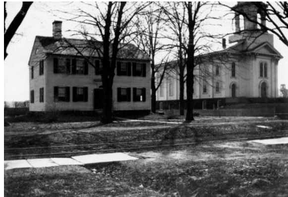
This photograph of the McKnight house and the third building of the Ellington Congregational Church was taken sometime after trolley service from Rockville began in 1906 and before the church burned in 1914.