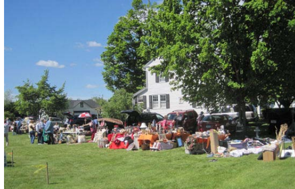
Flea Market 2010

On May 7, 2011 the historical society will hold a flea market on the Nellie McKnight Museum grounds from 9:00 a.m. to 2:00 p.m. The rain date is May 14. Spaces are 10' x 20' for a donation of $20 for non-members and $15 for members. Exhibitors of typical flea market/tag sale items are welcome. Craft and food exhibitors cannot be accepted.