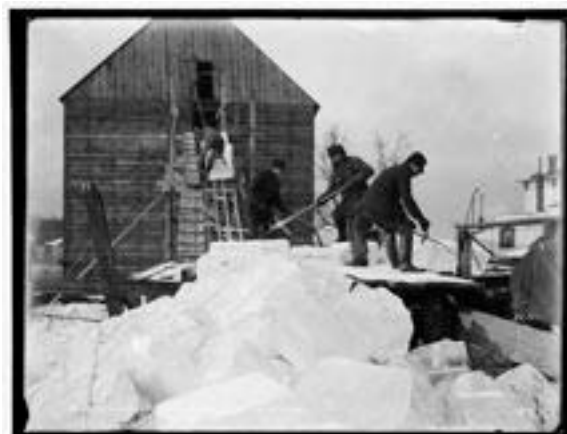
Ice harvesting, ca. 1903